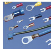
Terminal Loose Piece